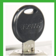
One key opens every console, cart, Shredinator & PDC