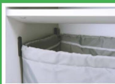
Nylon bag hooks makes bag fit tight. No paper misses the bag.