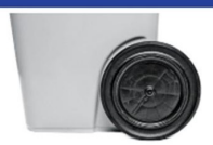
12" rubber wheels