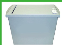
Lightweight design and grips on both ends allow for easy emptying