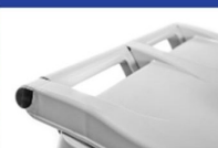
Durable and strong handles