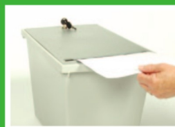
Compact size allows container to fit under desk, ensuring all paper is collected