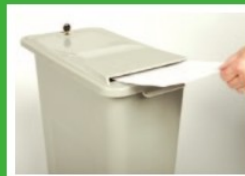
Design creates a 60lb high density stack of paper