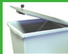
Sturdy lid and lock makes tampering nearly impossible