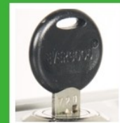
One key opens every console, cart, Shredinator & PDC