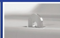
Hasp Lock Available