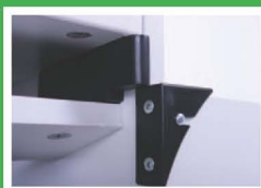
180 Degree nylon hinge for unobstructed collection