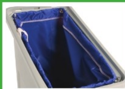
Optional internal nylon bags fit snugly against container