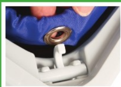
Optional swivel hooks stop tears and breaks of bags