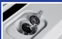
Lockjaw® locking system