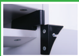
180 Degree nylon hinge for unobstructed collection