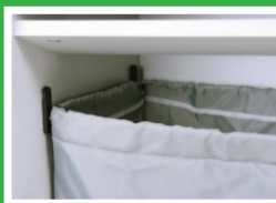
Nylon bag hooks makes bag fit tight. No paper misses the bag.