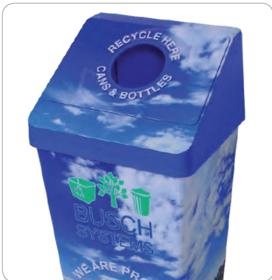
Can be wrapped with vinyl sticker (see pg. 19 for more info on wrapping)