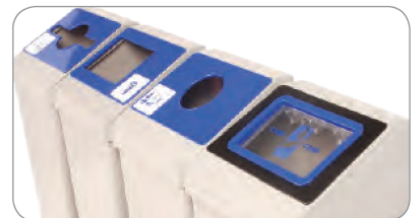
Wall-hugging design is ideal for tight spaces