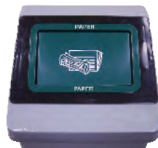
Optional self-closing flaps with stamp