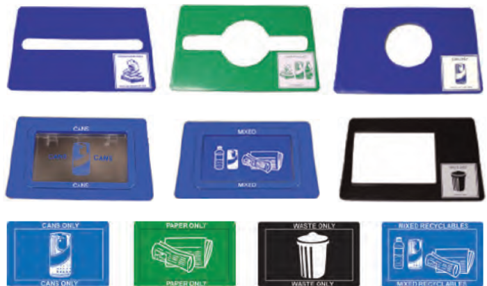
Openings and flaps ensure a clean sort